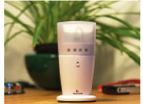
Flashing strobe light

Note - the smoke alarm still makes loud audible beeps to alert people without a hearing impairment.