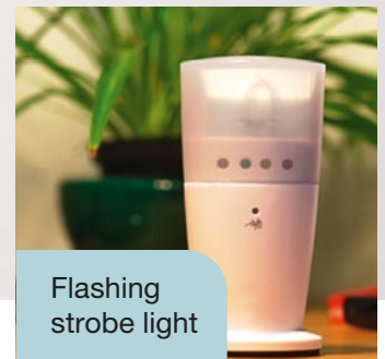
Flashing strobe light

When the smoke alarm is activated it sends a radio signal, activating the flashing strobe and the pillow shaker. Note - the smoke alarm still makes loud audible beeps to alert people without a hearing impairment.